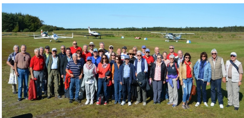
Figure 1: Fly-out participants at Laeso Aerodrome